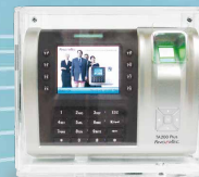
Q2i & TA200 Plus