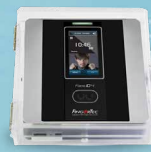
Face ID 4/4d