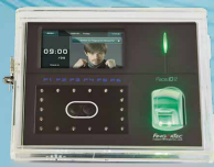
Face ID 2